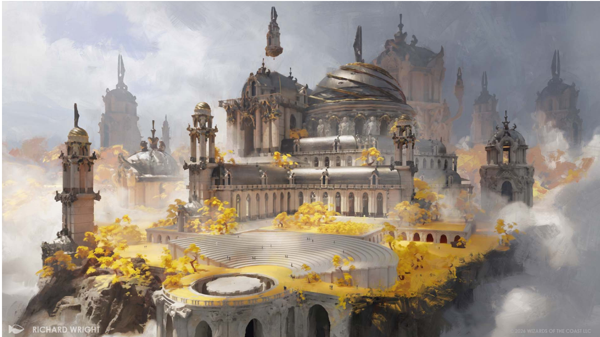
Forum of Amity

Killian’s fingers paused over a translator’s note. The ink on the page swelled under his touch, Doco encouraging his curiosity. “How do you and Crown know each other?”