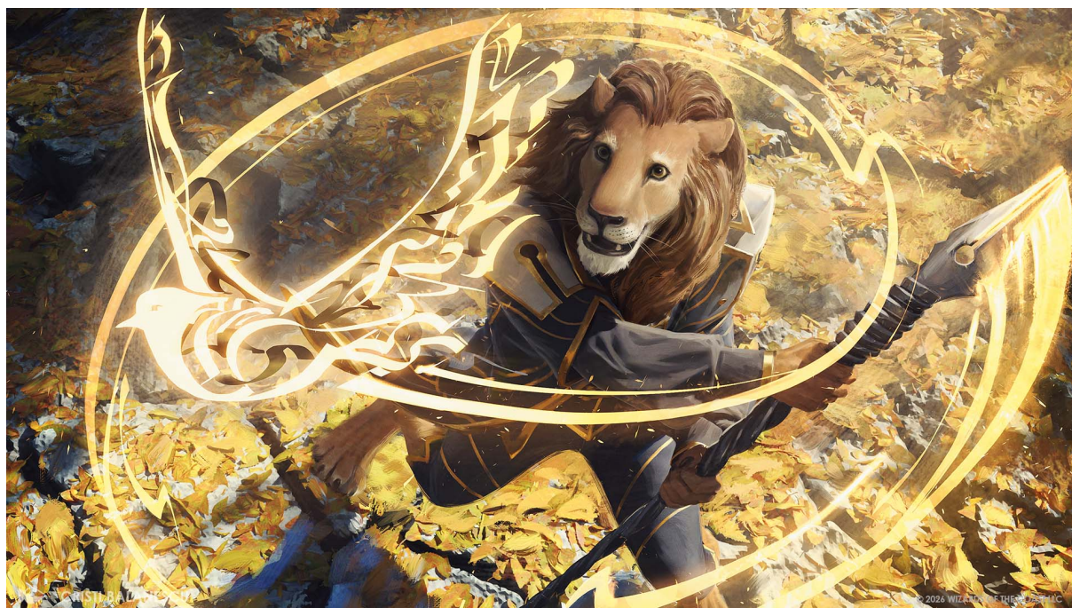
Eager Glyphmage | Art by: Cristi Balanescu

At Crown's gesture, the witness sigil burst apart in a flourish of desert and meadow flowers. The duelists drank in the light and were on each other in a whirl—a clash that was as much a show of speed and force as grace and skill. A clash that was defined less by victory than a celebration of the fact that they were fighting at all—that they had agreed to meet on terms forged in the name of resolution.